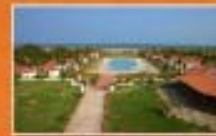
Fortune Chariot Beach Resort, Mamallapuram, Chennai